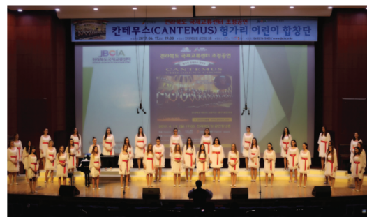
한국국제교류재단 공모사업 추진

Promote mutual exchange and communication between local and foreign residents through lectures on other countries, experience booths, international concerts, and other activities