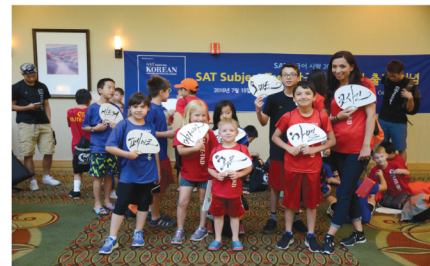
해외 민간교류 활성화 지원사업