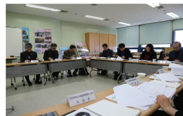
전북 국제교류 자원회