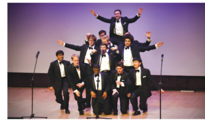
한국국제교류재단 공모사업 추진