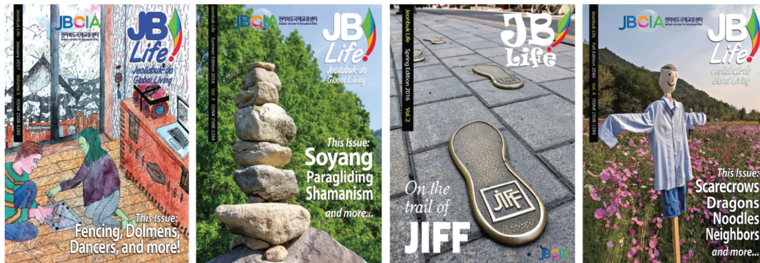
전라북도 영문 홍보잡지